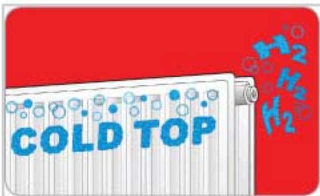
Radiators cold at top and need bleeding due to gases, a by product of rusting.