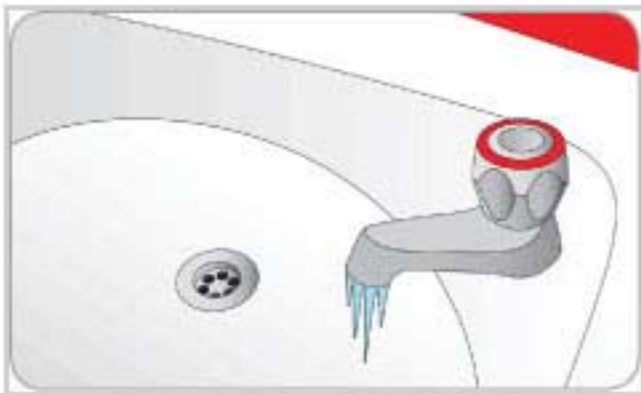
Little or no hot water due to blocked pipes and heat exchangers.