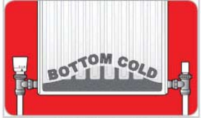
Radiators cold at bottom due to black sludge.